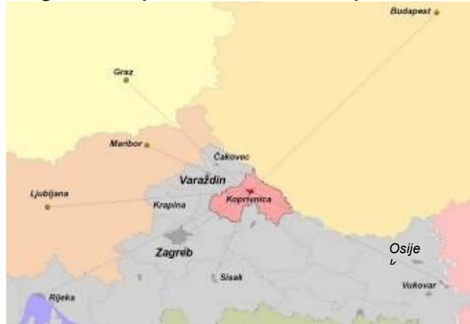
Image 3. KKC position in wider European context

Source: Koprivnica Križevci County Development Strategy 2011-2013. , page 10.