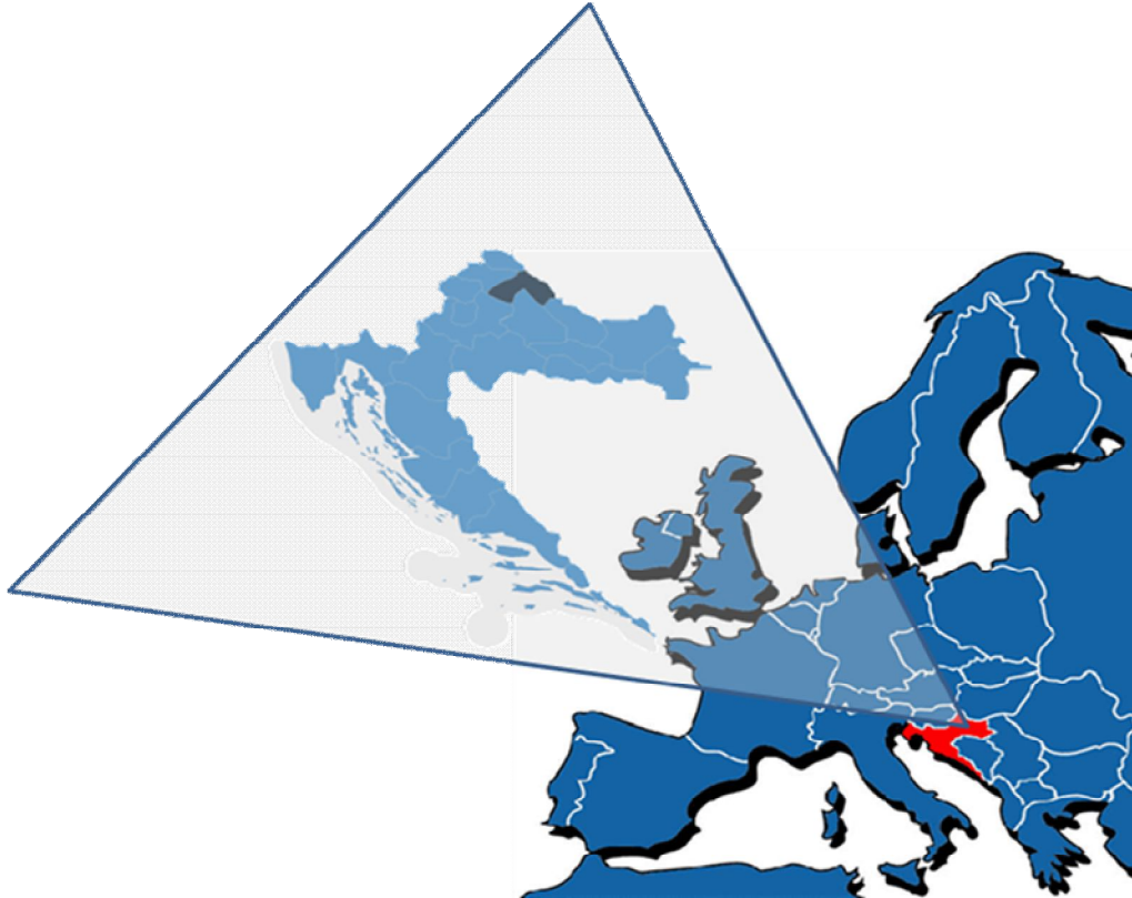
Image 1. Croatia's location